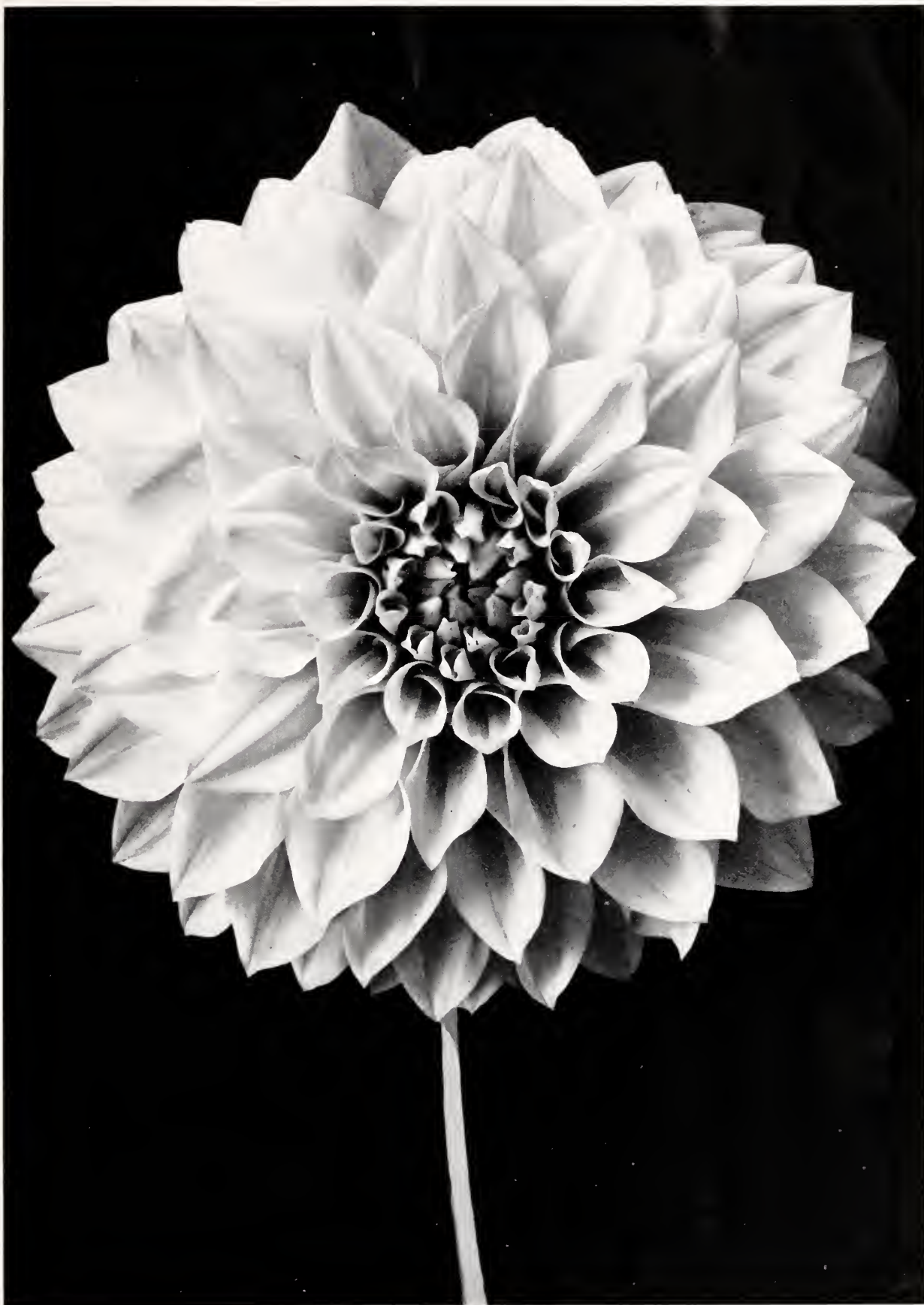
ST. HELENS MIST